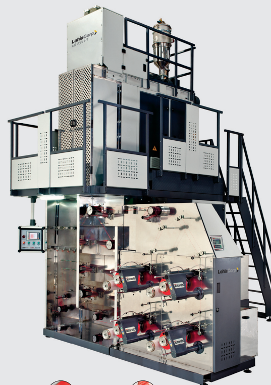
lofil 40/4 HT